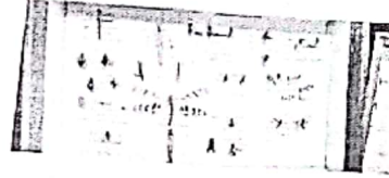
TABLE VERMICULTURE LIFE CYCLE