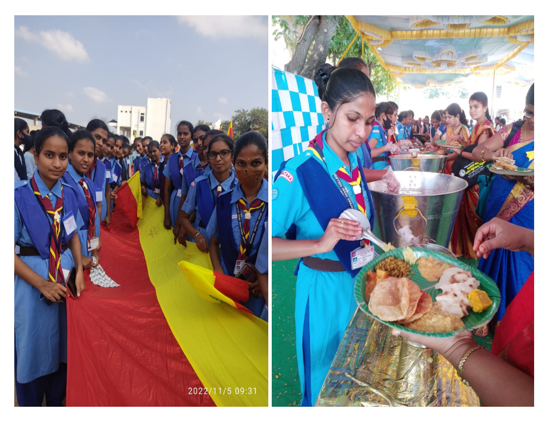
5 November 2022, Kannada Sahitya Samelena held at Rang Mandir Raichur, Rangers rendered their service.