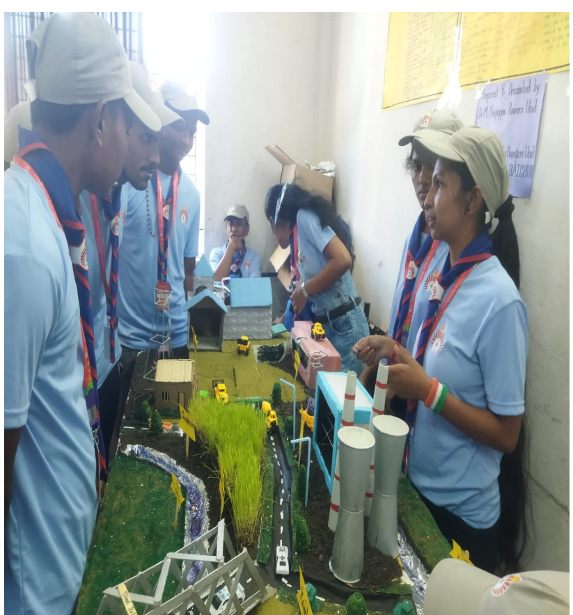
International Jamboree 2022 at Moodubidri, in the Science Exhibition Model, Executed and Bagged A Grade