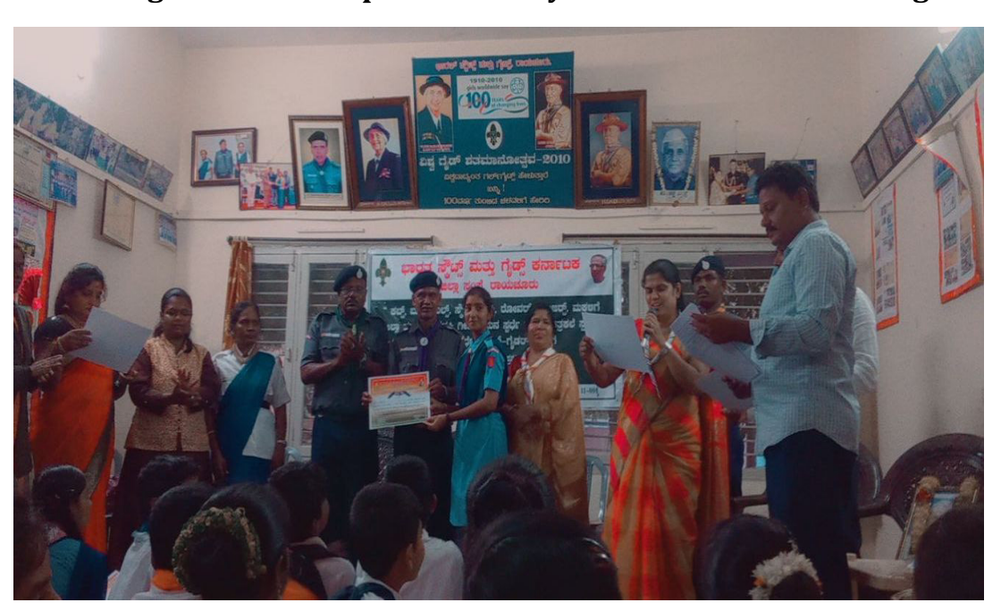
2<sup>nd</sup> Oct. 2022, Drawing Competition held at District Office, Raichur for Rangers, one of our student got first prize.