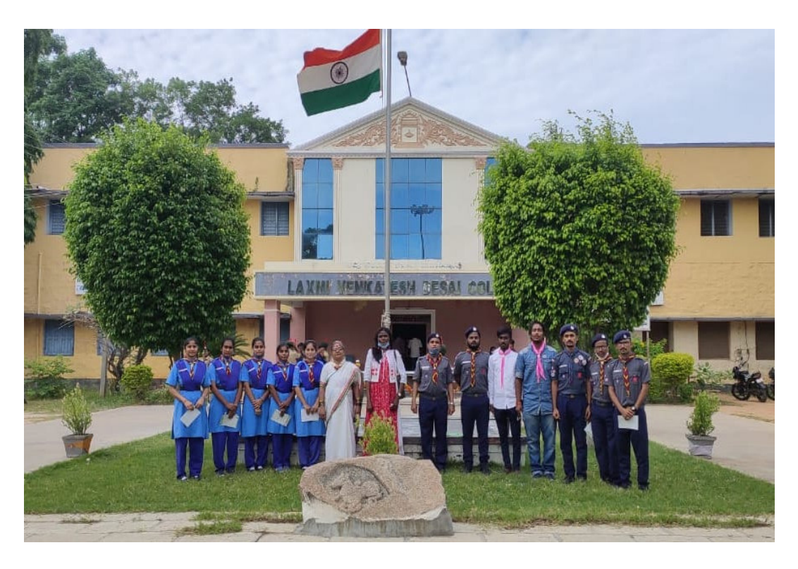
15th August 2022 Independence Day Celebration in our College