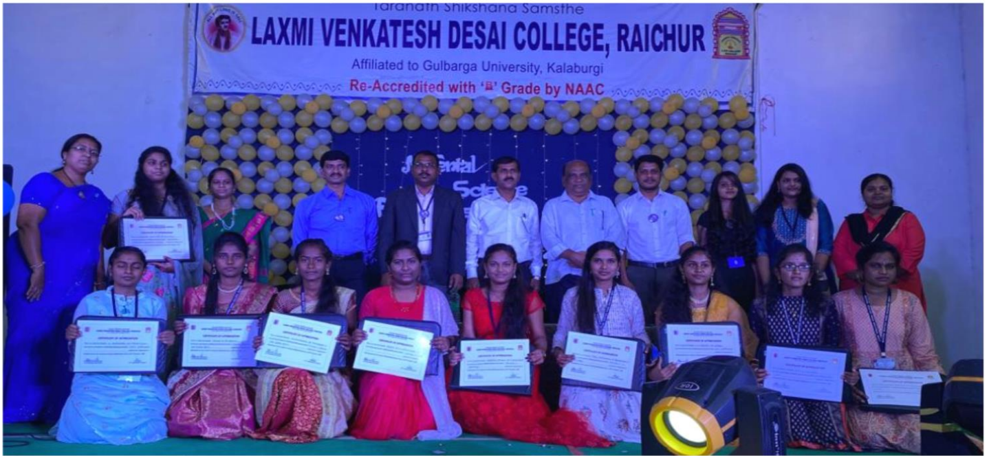
Students were Appreciated for their participation