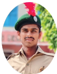
Somaraja - CDT Agniveer GD, Aro Belgaum